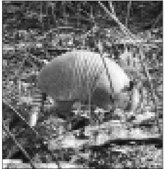
Nine-banded armadillo foraging. A primary concern of landowners with armadillos is the damage caused by their foraging behavior.

We captured 41 armadillos using long-handled dip nets and unbaited wire cage traps (Hawthorne 1994). All armadillos were captured and handled in compliance with the University of Georgia's Animal Care and Use Committee (IACUC) project A2004-10138-0. We assigned captured armadillos randomly